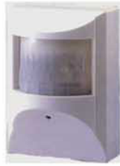
P.I.R WDP-900B (B&W) WDP-900C (color) (Non-functional)